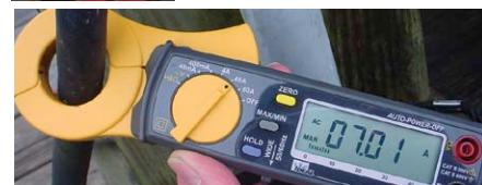
Top: An inexpensive circuit tester. Bottom: This clamp meter shows a 7-amp difference between the current going into the boat and coming out.